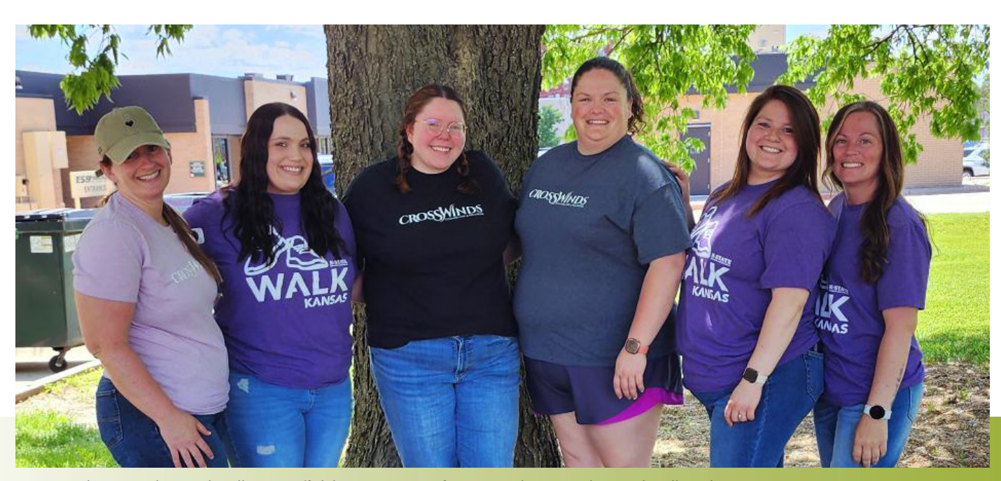
Crosswinds Counseling and Wellness staff.

Stepping Up counties played a key role in making a case for the expansion of Stepping Up to the juvenile justice system. It is through your insights and partnership with the TA Center that this project was made possible. The TA Center will work alongside additional CSG Justice Center staff to support this project, which will culminate in policy recommendations geared toward the behavioral health and juvenile justice systems in Kansas and the eventual launch of a juvenile justice-specific Stepping Up TA center.